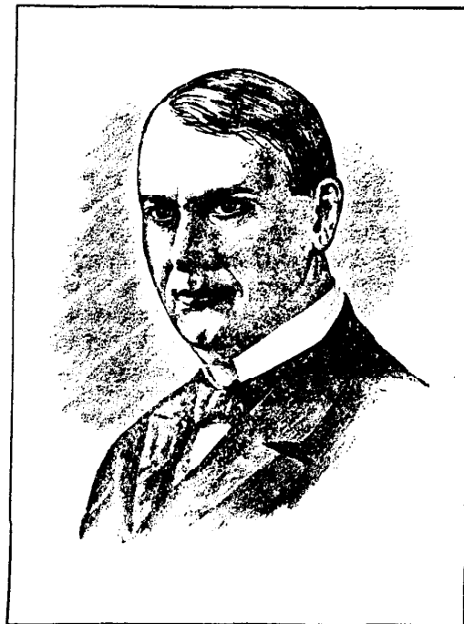
JOSEPH F. RUTHERFORD IN 1915